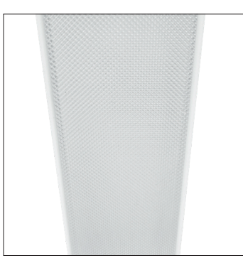
MP19H microprismatic diffusor