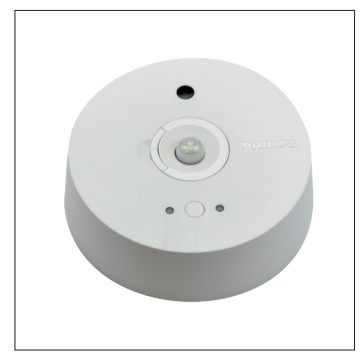
MCS wireless daylight&occ sensor