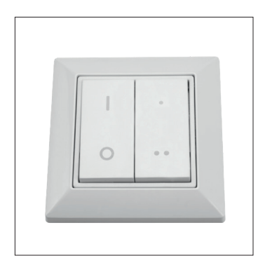
XCS wireless switch