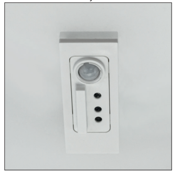
XC daylight&occ sensor