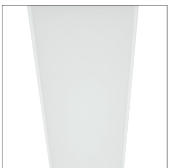
OP white acrylicl diffusor